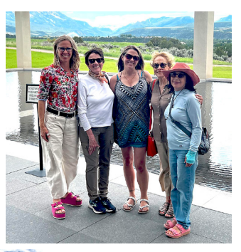
VVAG members took a trip to the other side of the mountains on June 7 to visit art venues in Basalt and Carbondale.